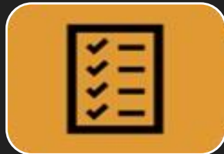
Assessment and reviews