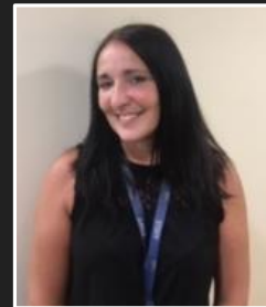
Pastoral and Learning Manager

Please click here to return to the home page.