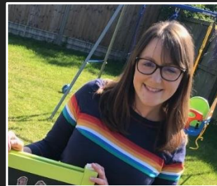
Special Educational Needs Co- ordinator