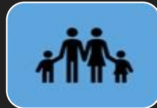
The whole child