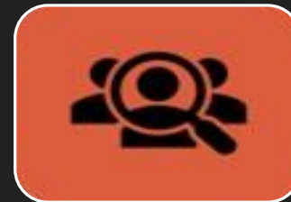
Meet the team