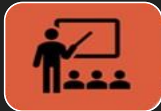
Approach to teaching and learning