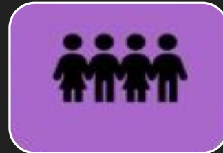
Children with SEND