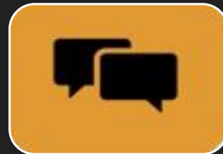
Complaints and policies